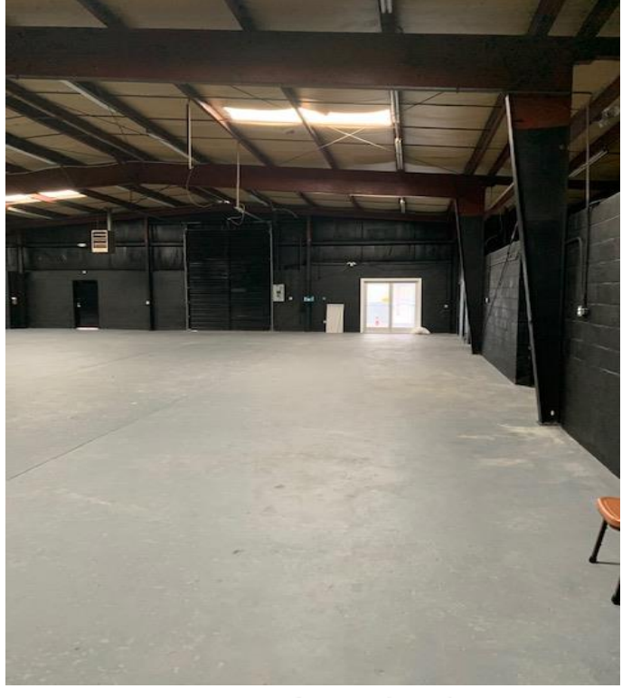
M.S. Shore Company, Inc. P.O. Box 2163 Greenville, SC 29602

Phone (864) 235-3898 Fax (864) 235-0448 msshore@msshore.com